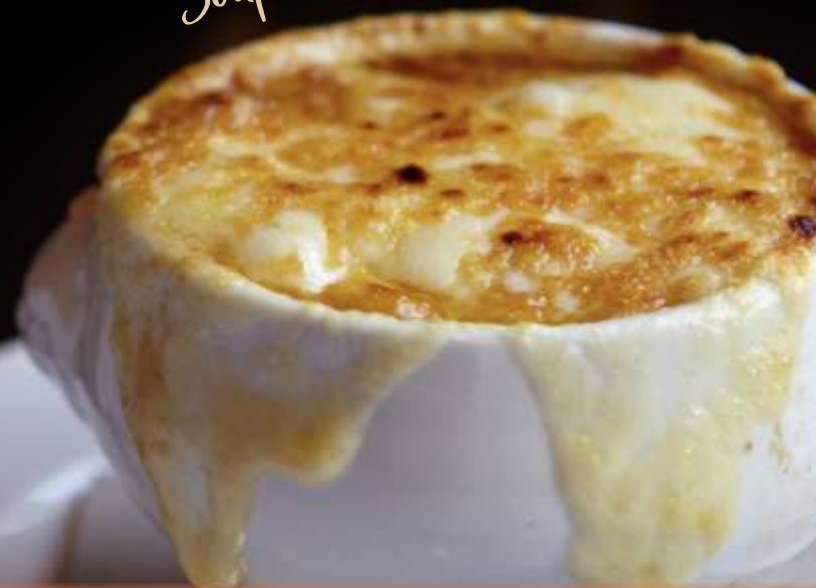
French Onion Soup

Grilled chicken, arugula, cucumber, mandarin orange, chickpeas, roasted red pepper, sunflower seeds, red onion & feta cheese in our homemade house dressing & honey drizzle.