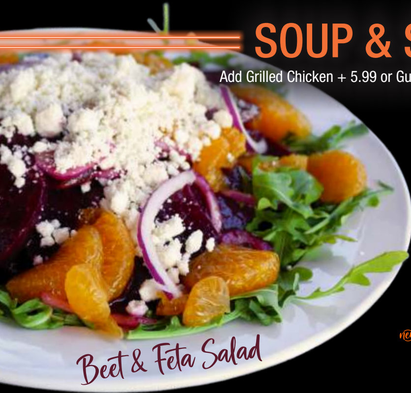
Beet & Feta Salad

Add Grilled Chicken + 5.99 or Guacamole + 3.99 to any salad.